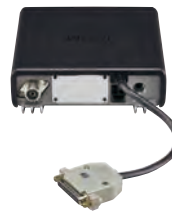
Optional OPC-2078 installation image