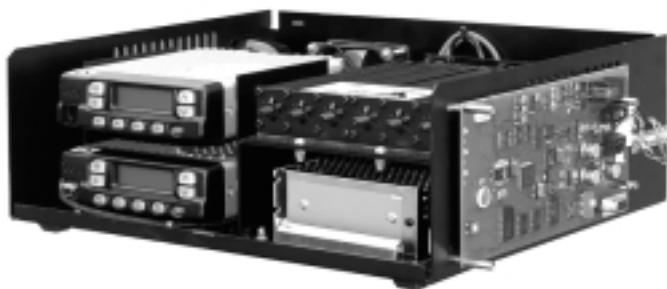
Repeater with phone patch IF-IT4.